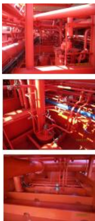
Figure 4: Examples of restricted access to sampling and measurement points

Both SOLAS and ISGOTT address access to and from vessels but apart from access to and from the bows of tankers, no particular regulation or recommendations exist for safe access around the decks of tankers. As can be seen from the illustrations in Figure 4 , safe access to and from sampling and measurement points can in some cases be almost impossible due to obstructions. In many cases, this is due to poor design.