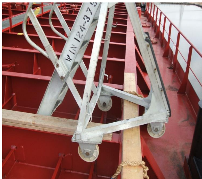
Figure 2: Difficulty in landing a shore gangway

To overcome the problem of accessing a gate or landing the gangway on handrails, a possible solution has been developed with a mounting that straddles the handrails. Figure 3 provides an example of this arrangement.