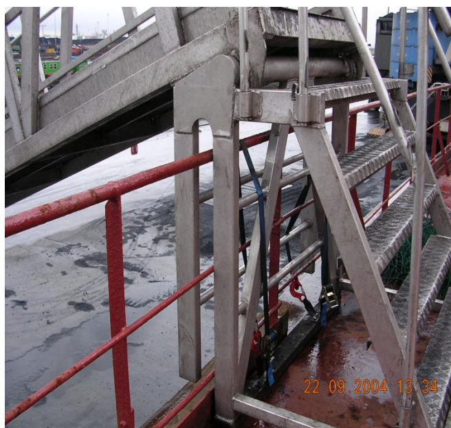
Figure 3: Shore gangway with supporting bulwark ladder arrangement